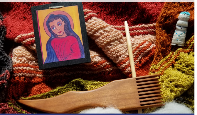
This session will explore the expression of the Divine Feminine through the Fiber Arts across different cultures. We will engage our creativity through a hands on knitting project. We will explore the peace and beauty of the contemplative acts of knitting, spinning and weaving.

Saturday January 18, 2020 9:30 am - 3:30 pm