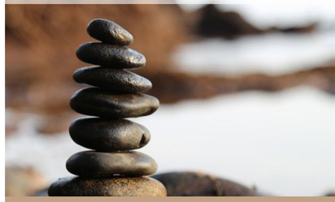
Experience a way of knowing that goes beyond one's rational understanding and embraces the whole of a person: mind, heart, and body.